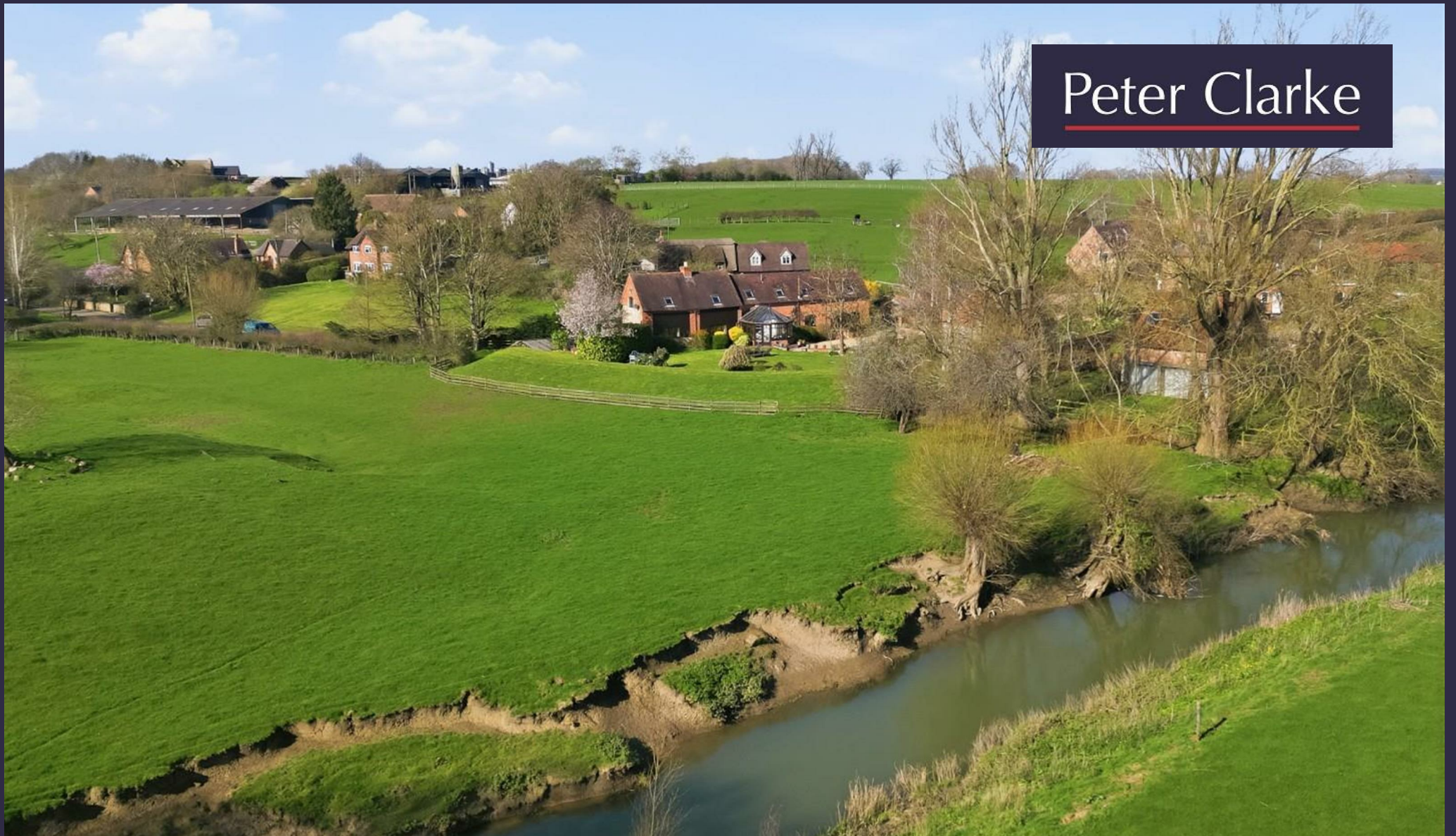
Millards House, Crimsote, Stratford-upon-Avon, CV37 8UE